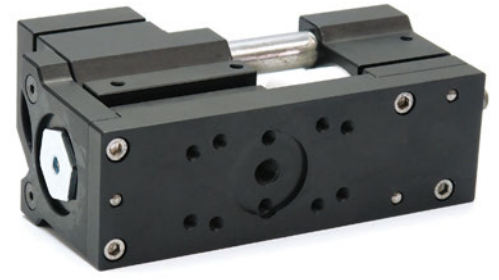
Mounting holes on bottom