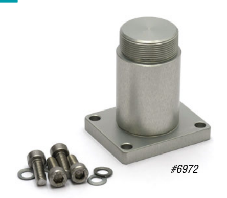
Mounting Accessories - Fasteners Included