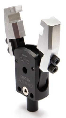
Example Custom Finger

Overlapping area when gripper is fully closed